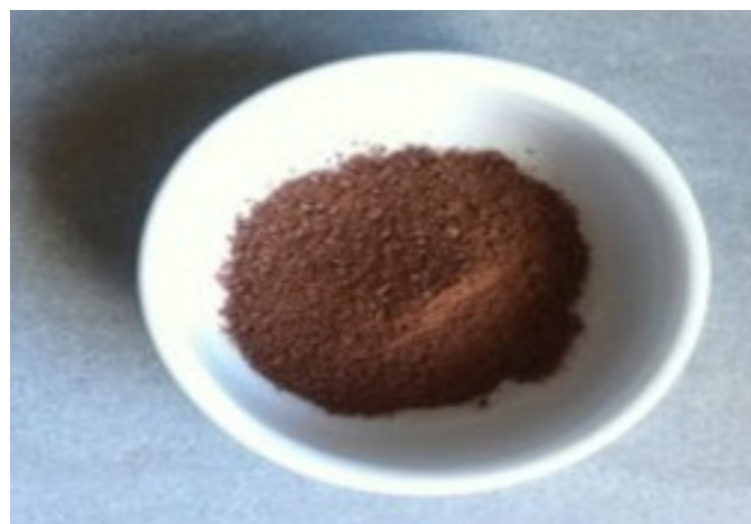
Fig 1: Coagulated pectin after ethanol addition and filtered