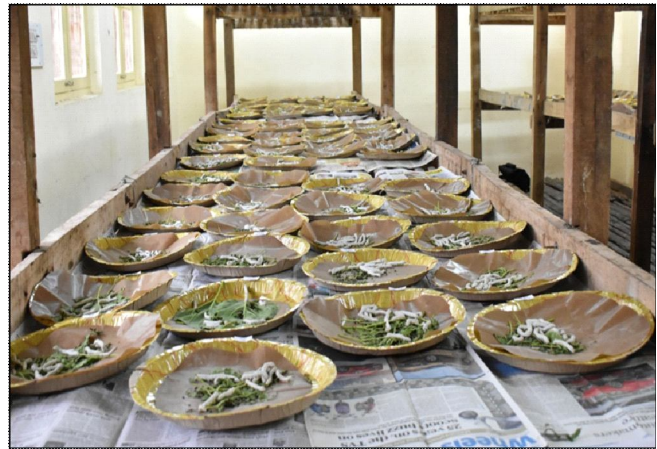
Fig. 1 : General view of silkworm rearing.

The larval mortality was found to be higher in all the batches of silkworms at 5 days after spray and decreased with an increase in interval after spray. Among the five pesticides treated, the maximum larval mortality was found in the silkworm batches fed with Azadirachtin 1 per cent (100%) followed by Chlorfenapyr 10 SC (23.25%), Era Safeguard (17.25%) and lowest in case of Orgomite (7.83%) sprayed batch at 10 days after spray followed by Wettable Sulphur