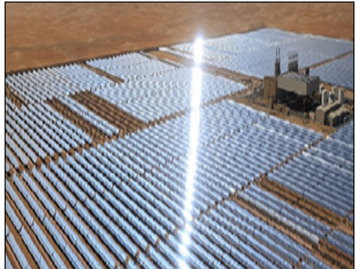
Fig. 3: Solar power plant model