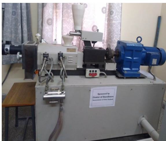
(Fig.1 A-Twin screw extruder)

Total quantity of each sample prepared was 500gm (C=Control, C1=5%, C2=10%, C3=15%, C4=20% sample)