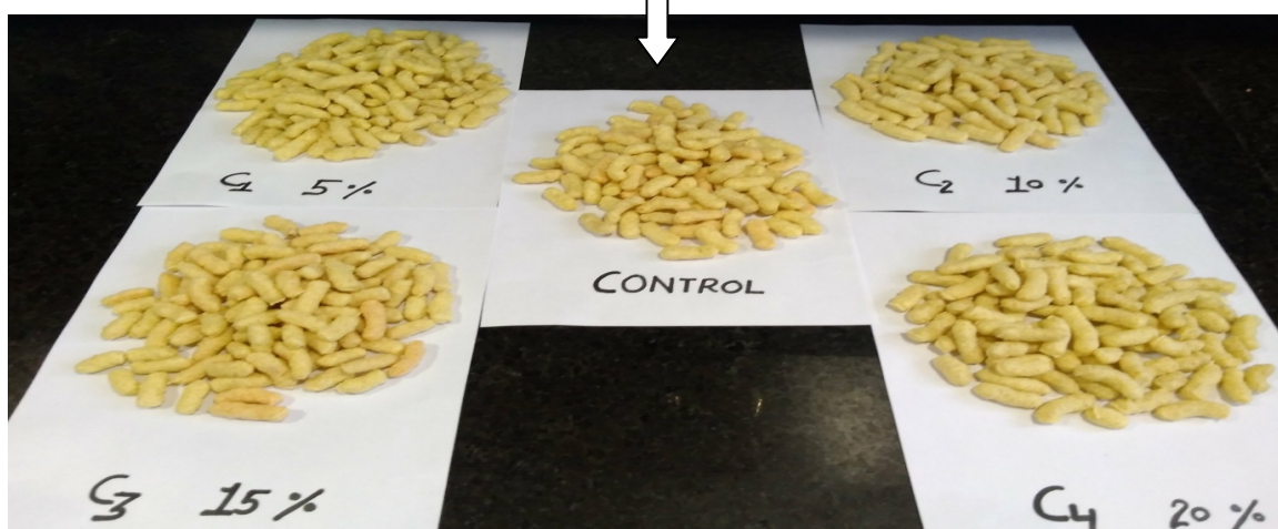
Fig. 2 : Extruded puff products, (C=Control, C1=5%, C2=10%, C3=15%, C4=20% Amaranth blended samples)