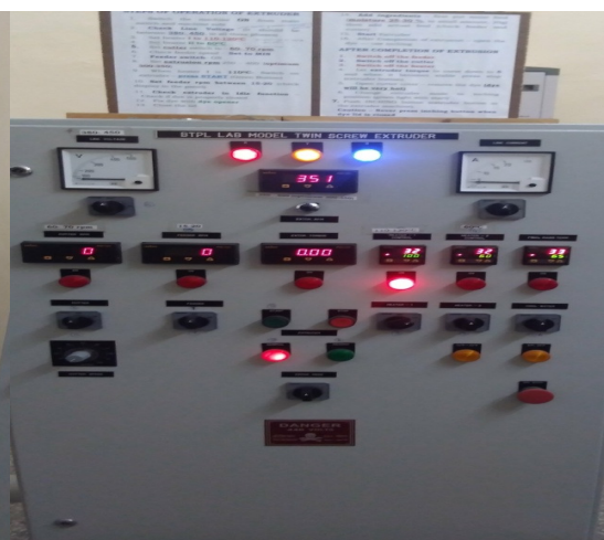
(Fig. 1 B-Control Panel of twin screw extruder)