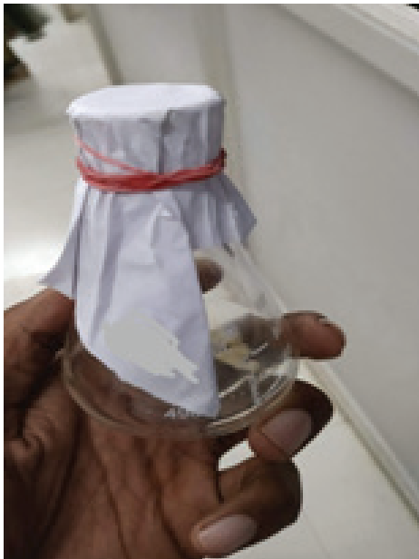
Figure 4: Casein Before Centrifugation