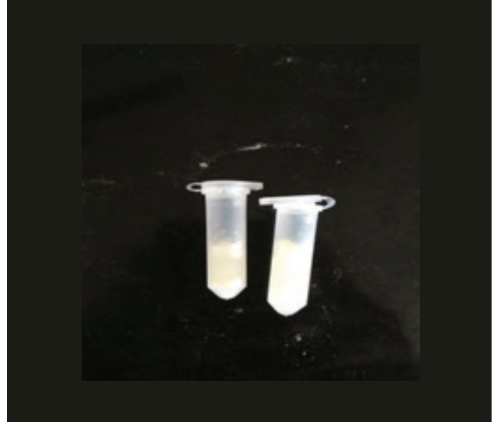
Figure 6: Water Resistant Glue in eppendorf