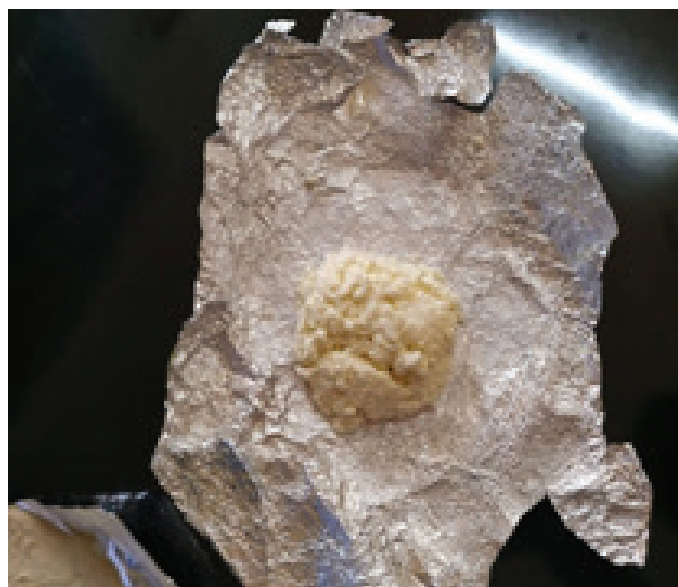
Figure2: Casein of Pastured Milk