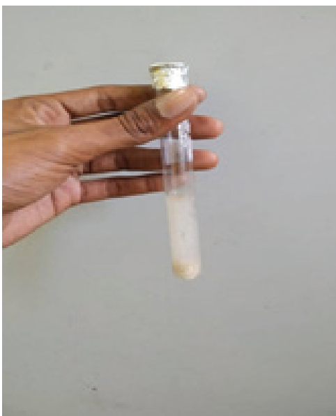
Figure 5: Casein with 1N of NaOH, dis H 2 O & Papain