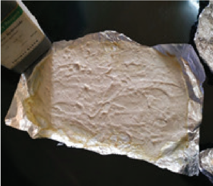
Figure 3: Casein of Soya Milk