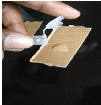
Figure 8: Applying Glue on Card Board

Acidic pH was maintained by the incorporation of 1N NaOH. Different volume of sample was obtained after 2 hrs & reaction was arrested by heating 90°C for 10 mins sample centrifuged at 12,000 rpm for 15 mins. Supernatant collected freeze dried & stored at -20°C for subsequent analysis.