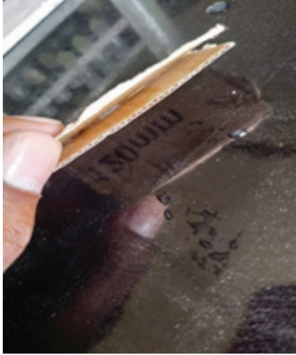
Figure 9: Two card Boards were stacked using Glue shows three different dried casein preparations from various types of milk

The casein thus prepared was centrifuged and dissolved for the preparation of glue which is shown in Figure -4,5