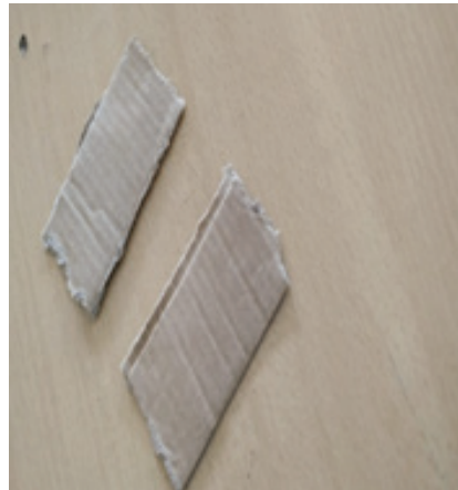
Figure 7: Two Card Board Pieces