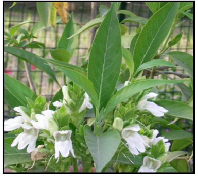
Fig. 1: Adhatoda Vasica (Whole Plant)