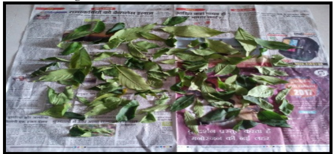
Fig. 2: Dried Leaves