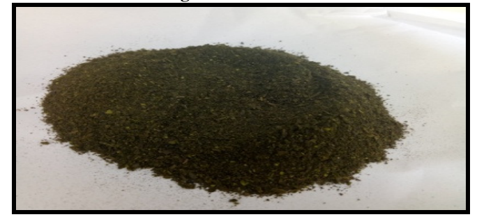
Fig. 3: Powdered Leaves

Plant Description: It is an evergreen shrub of 1-3 feet in height with many long opposite branches. Leaves are large and lance-shaped. Stem herbaceous above and woody below. Leaves opposite and exstipulate. Flower spikes or panicles, small irregular zygomorphic, bisexual, and hypogynous (Shinwari and Shah, 1995) It has capsular four seeded fruits. The flowers are either white or purple in colour. Its trade