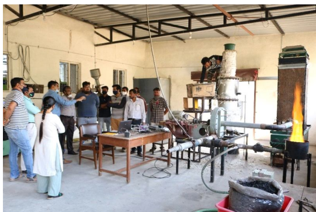
Fig. 1 : Developed open-core throat less downdraft gasifier.

The experimental setup consists of an open-core throat less downdraft gasifier with a cyclone separator, tar separator and cooling tower developed at the Department of Renewable Energy Engineering, CAET, JAU, Junagadh with a capacity of 80 MJ/h. Fig. 1 shows the developed open-core throat less downdraft gasifier. Feeding of shredded biomass is carried out at the top of the reactor