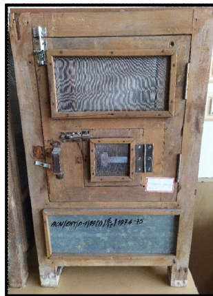
Fig. 2 : Oviposition cage.