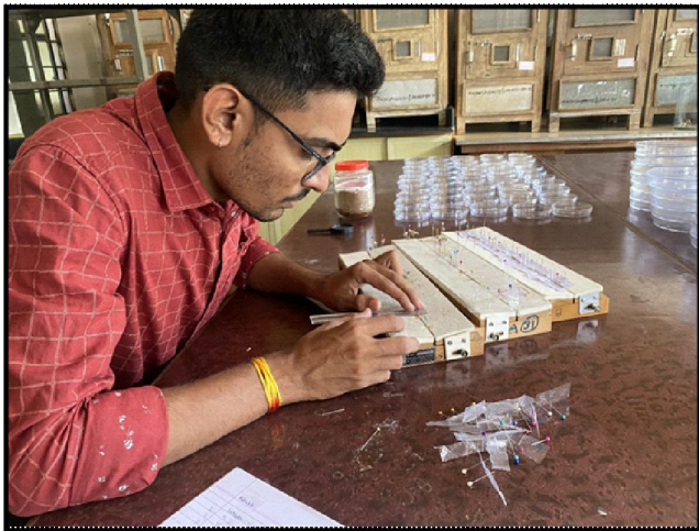
Fig. 5 : Measurement of E. vittella adult.

adult was considered as pupal stage. Observation on length and breadth of pupa were measured with the help of measuring scale.