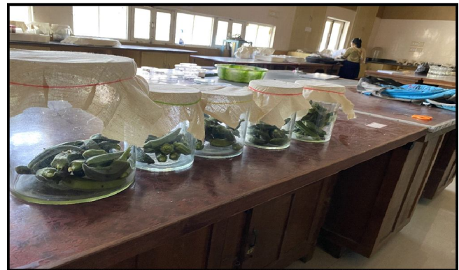
Fig. 1 : Damaged fruits of okra collected from field.

To know the pupal measurement, the larva was observed from the time, when it stooped feeding and become sluggish to the time when it turns to pupa. The duration between formation of pupa to the emergence of