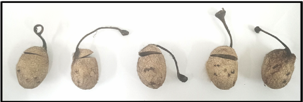
Fig. 2: Cocoon of Sarihan Ecorace

Rearing and grainage performance of Sarihan Ecorace by Regional Sericultural Research Station, Dumka