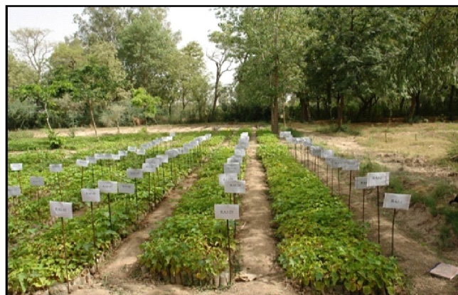
Fig. 1: Overview of Experimental Field.

and demonstration farm of Ruchi Bio Fuels Pvt. Ltd. at Gawla Talab, Maheshwar located between 22°12'25" N latitude, 75°35'26" E longitude with an elevation of 600 meter at sea level at Khargon district of Madhya Pradesh, India. Elite progenies of healthy and uniform cuttings of 20-25 cm long and 2-3 cm thick of J. curcas were taken from the middle portion of one-yr-old branches of three-yr-old plants during the month of February. Cuttings were dipped in 0.1% bavist in fungicide for 2-3 min and subsequently washed in distilled water before giving hormonal treatment. These were divided into 12 groups of 120 cuttings each. Group 1 was treated with distilled water as control. Groups 2-7 were treated with 50, 100 and 150 ppm of in dole-3-butyric acid (IBA) and 100, 200 and 300 ppm naphthaleneacetic acid (NAA). Cuttings were treated by submersing about 3 cm basal portion in each treatment solution for 24 h. Cuttings were then transferred into well prepared ridge bad as rooting