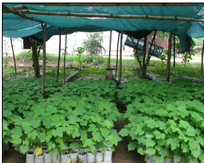
Fig. 2: Stem cuttings of Jatropha curcas in root media.

medium. 40 cuttings were planted in each bad and randomly 3 beds were selected for each treatment. Rest of the 5 groups were also treated with distilled water and planted in next 15 beds 3 beds for each group. These beds had 5 different soil treatments i.e. , FYM 25 t. ha -1 , neem cake @ 10 t.ha -1 , vermicompost @ 10 t.ha -1 , poultrymanure 10 t.ha -1 and chemical fertilizer (NPK) @ 0.50 t.ha -1 . Irrigation and other operational practices were applied as per weather conditions and soil moisture status. The cuttings were started sprouting after ten days of planting and the data for complete sprouting were taken daily up to 21 days after planting. The data on growth i.e. , sprout length; root length and dry biomass of shoot and root were taken at weekly interval for 30 days onwards upto the 90 days of planting to compare the growth performance of seedlings as influenced by different treatments.