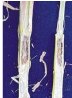
Plate 5 : MRCL 1 (MR).