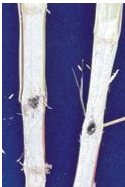
Plate 1 : MRCL 33 (R).