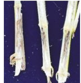
Plate 6 : MRC L 23 (MS).

The lines MRC L 6, MRC L 13, MRC L 29, MRC L 33 has shown the resistance reaction towards both the pathogens ( Macrophomina phaseolina and Fusarium verticilloides ). The lines MRC L 1, MRC L 20, MRC L 24, MRC L 25, MRC L 26, MRC L 27, MRC L 30, MRC L 31 has exhibited the reaction of moderate resistance towards both the diseases and the lines MRC L 22, MRC L 32, MRC L 15, MRC L 38 has shown moderately susceptible to susceptible reaction to both the pathogens. The resistant check has shown a disease reaction of 2.5 and susceptible check has shown a reaction of 7.8. When the disease score of two seasons is compared the disease reaction is more in kharif than in Rabi . Similar results