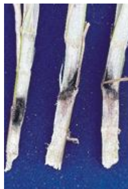
Plate 2 : MRCL 37 (MR).