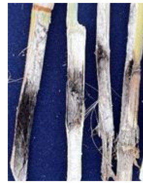
Plate 3 : MRCL16 (MS).