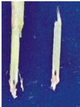
Plate 4 : MRC L 17 (R).