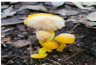
Fig. 5 : Fusarium sporotrichioides .

It is a red open-chain unsaturated carotenoid, acyclic isomer of beta-carotene and longer than any other carotenoid. Lycopene, also known as psi-carotene is very sensitive to heat and oxidation and is insoluble in water. Because of the abundance of double bonds in its structure, there are potentially 1,056 different isomers of lycopene, but only a fraction is found in nature. In a study cis -isomers of lycopene were shown to be more stable, having higher antioxidant potential compared to the all- trans lycopene. Genetically modified fungus Fusarium sporotrichioides was used by Jones et al to manufacture the colourant and antioxidant lycopene. They used the cheap corn fiber material as the substrate. Cultures in lab flasks produced 0.5 mg (lycopene)/g of dry mass within 6 days and such a production will be increased within the next years.