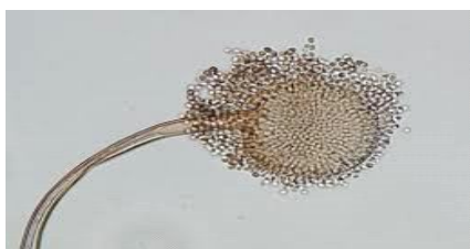
Fig. 2 : Penicillium oxalicum .

It is the red pigment produced by the strain Penicillium oxalicum obtained from the soil. It contains