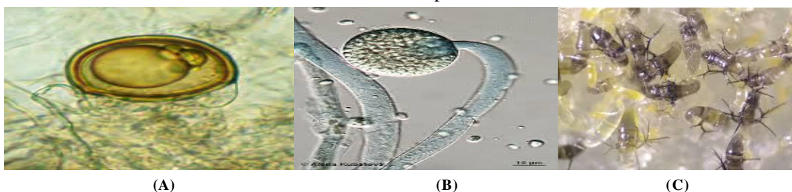
Fig. 1 : (A) Blakeslea trispora , (B) Mucor circinelloides , (C) Phycomyces blakesleeanus .