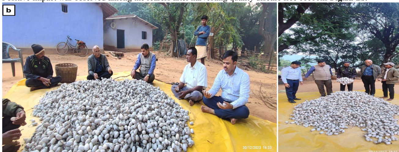
Fig. 2 : Disease free quality cocoons production after stringent implementation of disease monitoring module (a) Harvesting of cocoons (b) Counting of cocoons

This observation signifies the stern implementation of disease monitoring module has carried out in the states having less cocoon rejection due to the disease incidence which depicts a effective impact of following the disease monitoring module which was observed in Jharkhand and other states which showed less disease infection. Positive impact was observed among the rearers after harvesting quality disease free cocoons Fig.2a-2b.