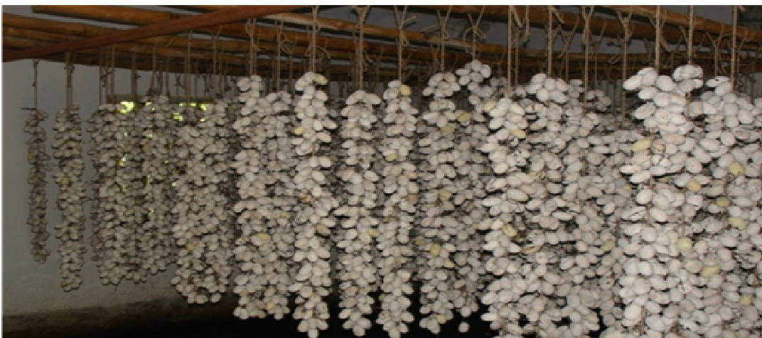
Fig. 3 : The garlands prepared for nucleus seed cocoon preservation.

called Jeevan Sudha once per instar, twice per second, and three times per instar of the silkworm larvae. In order to identify the pebrine spores during microscopic examination in silkworms, a rigorous three-tier mother moth examination was conducted in tasar grainages using the Pebrine Visualization Solution (PVS). In addition, garlands made of Seed cocoons were kept in the grainage hall. Using jute thread at the tips of the peduncles, garlands made from both male and female cocoons (60:40) were prepared (Fig. 3). To make cleaning the floor easier, the garlands were hung two feet above the floor.