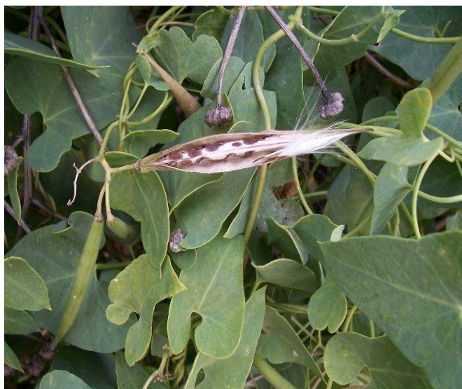
Climbing plant Sinomenium acutum

Sinomenium acutum was first recorded as a herbal medicine in Japan. Its main pharmacological actions are immunosuppression, arthritis amelioration, anti-inflammation, and protection against hepatitis induced by lipopolysaccharide (LPS). The plant was traditionally used in herbal medicine in Japan and China for rheumatism and arthritis. Sinomenine (SN) is the main alkaloid found in this plant. The main action of SN is neuroprotection, which has been demonstrated in brain injury models (Nishida and Satoh, 2006). Its anti-rheumatic effect was thought to be primarily mediated via release of histamine, but other effects such as inhibition of prostaglandin, leukotriene and nitric oxide synthesis may also be involved (Yang and Yang, 2003). It increases the chloride influx in the primary cultured hypothalamic neuronal cells. SN is a morphinan derivative, related to opioids such as levorphanol and the non-opioid cough suppressant dextromethorphan (Liu et al. , 2006). SN is mainly used for the clinical treatment of Rheumatoid arthritis (RA), due to its anti-inflammatory and immunomodulative actions (Liu et al. , 1994; Wang et al. , 2003; Wang et al. , 2004).