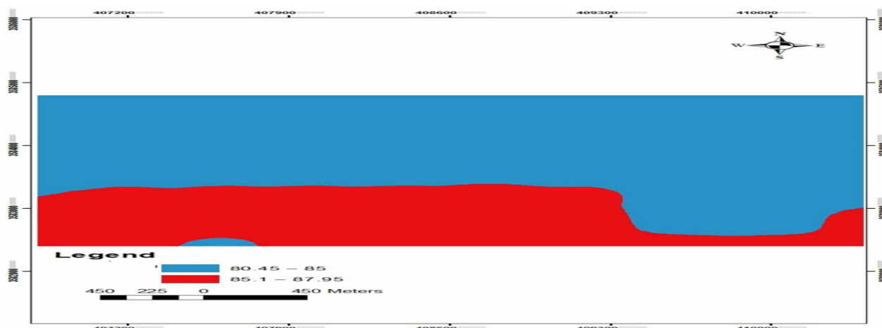
Fig. 2 : Shows the suitability of soils in the studied area to growing maize crop