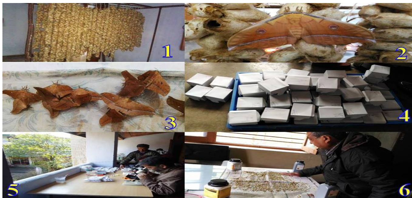
Fig. 3 : Oak tasar Grainage activities

microscopic examination, numbers of dfl's produced and cocoon dfl's ratio for both mass and cellular examination was collected. The three year data for Mass examination (from 2013 to 2015) and cellular examination (from 2016 to 2018) was collected separately for data analysis.