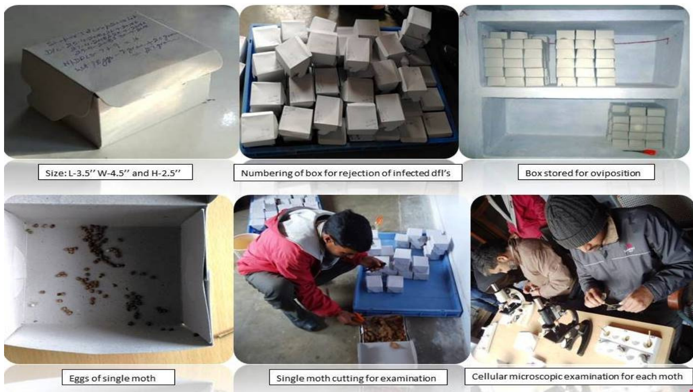
Fig. 4 : Cellular moth examination