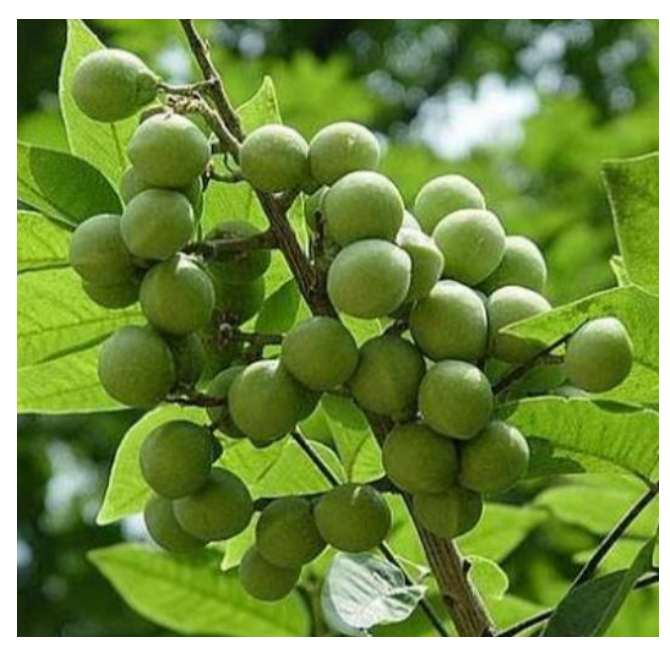
Photograph 18: Sapindus mukorossi19. Sapindus trifoliatus L.Family: Sapindaceae

Status: The species is widely grown in upper reaches of the Indo-Gangetic plains, Shivaliks and sub-Himalayan tracts at altitudes from 200m to 1500m. It is also in cultivation for its commercial use.