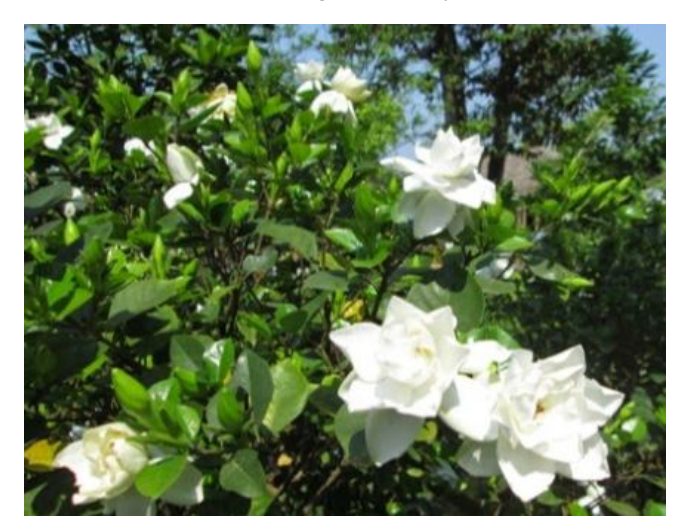
Photograph 14: Gardenia campanulata

Status: Rare and wildly in distribution. In India it is distributed in Sikkim Himalaya, North East India and Bihar. Distributed in Bangladesh, Myanmar & Java.