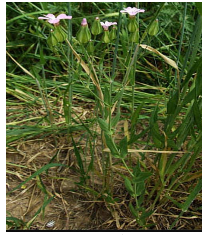
Photograph 21: Vaccaria hispanica

Europe; sometimes cultivated in gardens of India & Tibet as an ornamental.