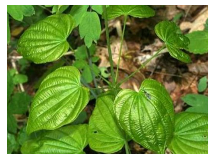
Photograph 11: Dioscoria deltoidea 12. Diploknema butyracea (Roxb.)H.J.Lam. Family: Sapotaceae

Status: In India it is distributed in Kashmir and Punjab eastward to Nepal &Khasi hills. Rarely distributed in north parts of Gangetic plain near foothill of Himalaya.