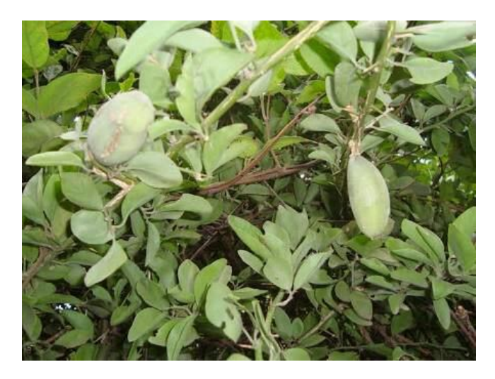
Photograph 7: Balanites aegyptiaca

Medicinal and cleansing uses: Desert date fruit is mixed into porridge and eaten by nursing mothers, and the oil is consumed for headache and to improve lactation. Oil from the fruit is used to dress. Bark extracts and the fruit repel or destroy freshwater snails and copepods, organisms that act as intermediary hosts host the parasites Schistosoma, including Bilharzia, and guinea worm, respectively. Existing worm infections are likewise treated with desert date, as are liver and spleen disorders. A decoction of the bark are also used as an Abortifacient. The seed contains 30-48% fixed (non-volatile) oil, like the leaves, fruit pulp, bark and roots, and contains the sapogenins diosgenin and yamogenin. Saponins likewise occur in the roots, bark wood and fruit. Diosgenin can be used to produce hormones such as those in combined oral contraceptive pills and corticoids. Fruit juice used in cleaning silk and cloth due to mild acid in it (Agarwal, 1986, Jain, 1991).