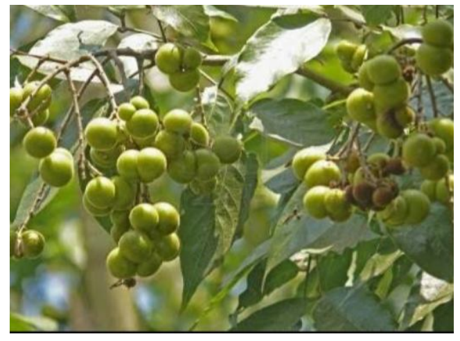
Photograph 17: Sapindus emigrinatus

Medicinal and cleansing uses: Fruits used for washing clothes and cleaning body (Agarwal, 1986; Pant,