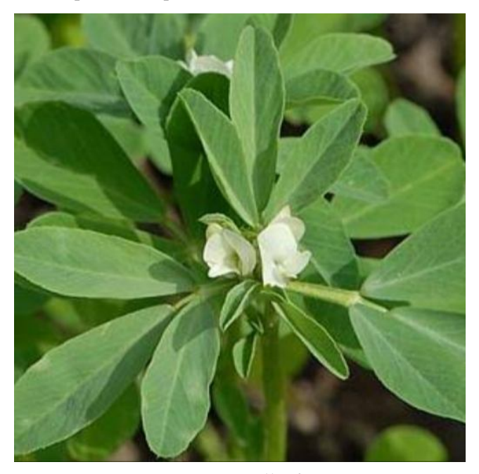
Photograph 20: Trigonella foenum-gracecum

Status: Fenugreek has spread as a cultivated crop across the Asian and the African continents. In India it is cultivated throughout, naturalized in Jammu & Kashmir, Punjab & Upper Gangetic plains; Pakistan, Orient, Arabia, S. Europe & Ethiopia.