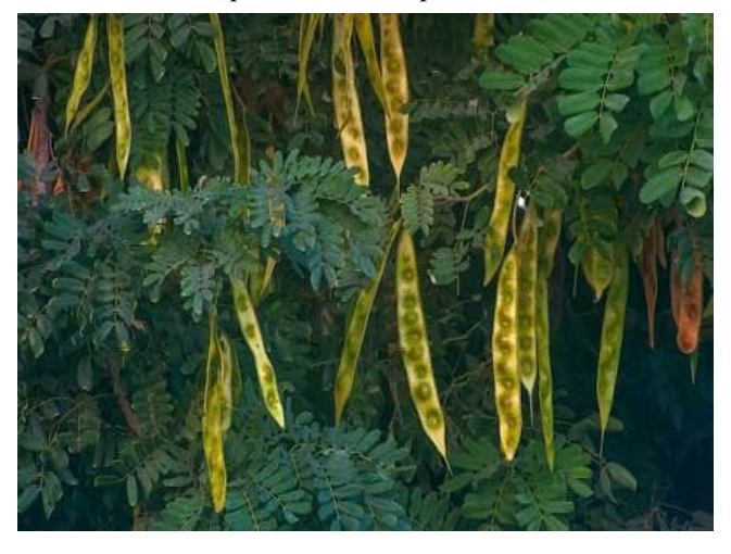
Photograph 3: Albizia lebbeck

Status: Native to India, Pakistan, Bangladesh, the Andaman Islands, Burma, S China, NE Thailand, and Malaysia; possibly also Sri Lanka, the eastern islands of Indonesia, Africa and N Australia. Naturalized in: Many countries of the tropics and subtropics. Found in deciduous and semi-deciduous monsoon forests, and rainforests in its native habitat, and in a variety of situations in the humid and semi-arid tropics and subtropics.