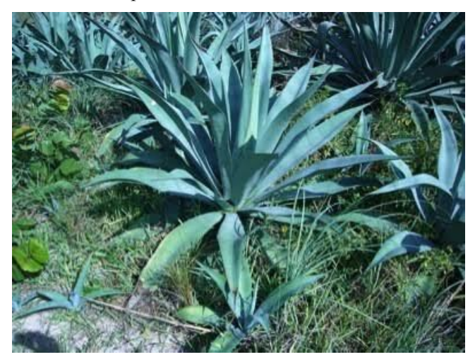
Photograph 2: Agave americana

Status: Original habitat is unknown but it grows wild in Mexico. Introduced in Punjab and Bombay Presidency as a hedge plant. It is exotic in India. Mostly cultivated as ornamental plant.