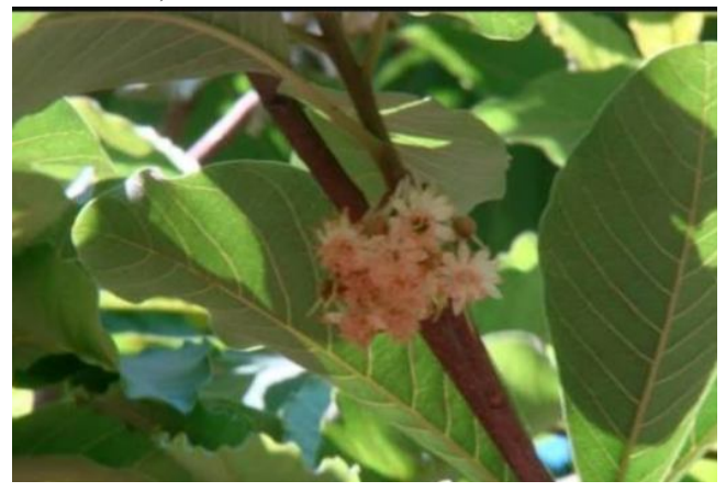
Photograph 12: Diploknema butyracea

Status: Wildly distributed in India. Indian Butter Tree is found in the Himalayas, at altitudes of 1600 m, from Uttarakhand to Sikkim, also in Andaman & Nicobar. Having such a great economic and medicinal value Diploknema is facing extinction because of relentless anthropogenic pressure. These species are failing to regenerate in spite of reasonable seed production (Negi et al. , 1988).