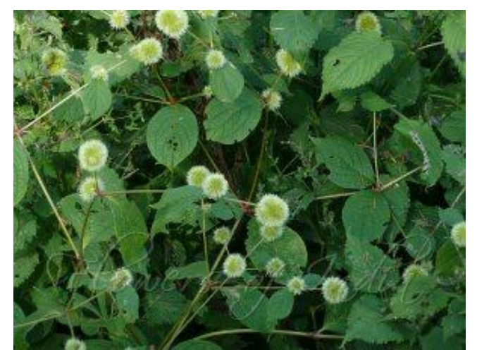
Photograph 10: Cyathula capitata11. Dioscorea deltoidea Wall. ex GrisebFamily: Dioscoreaceae

Status: Cyathula capitata Moq. (Amaranthaceae) is a frequent shrub in mid hills of Uttarakhand. It is also common along Valley of Flower track above Govind Ghat. Wild in distribution.