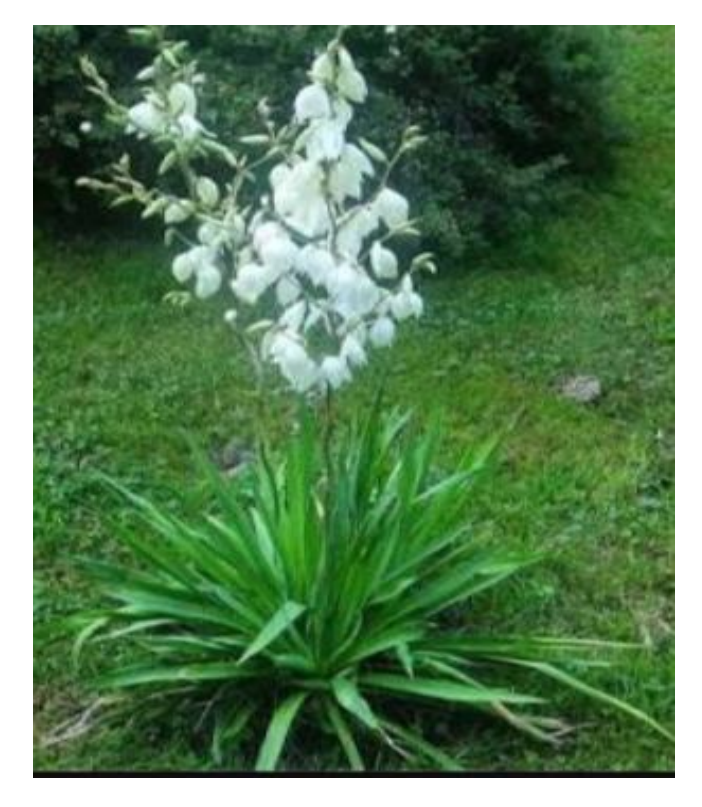
Photograph 22: Yucca filamentosa