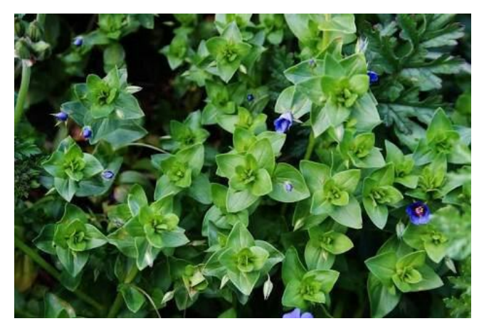
Photograph 5: Anagallis arvensis

Status: The native range of the species is Europe and Western and North Africa. The species has been distributed widely by humans, either deliberately as an ornamental flower or accidentally. A. arvensis is now naturalised almost worldwide, with a range that encompasses The Americas, Central and East Asia, the Indian Subcontinent, Malesia, the Pacific Islands, Australasia and Southern Africa. In India, it is wildly distributed.