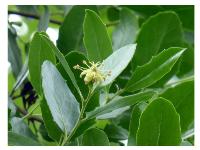
Photograph 16: Quillaja saponaria