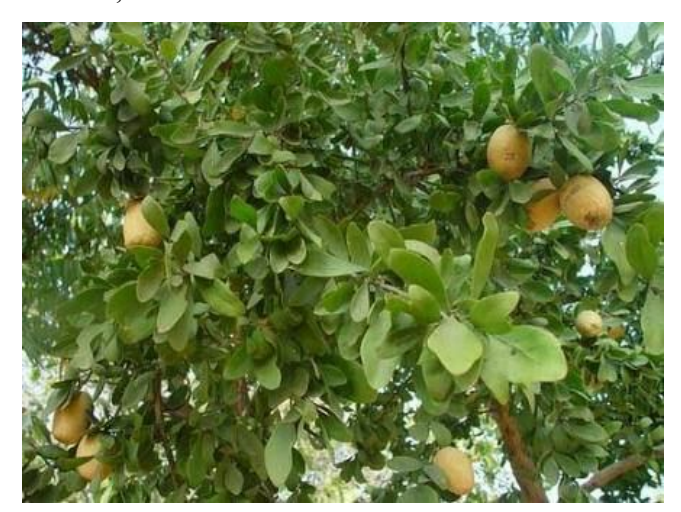
Photograph 8: Balanites roxburghii

Status: B. aegyptiaca has wide ecological distribution. Natural distribution is obscured by cultivation and naturalization. It is believed indigenous to all dry lands south of the Sahara, extending southward to Malawi in the Rift Valley, and to the Arabian Peninsula. Introduced into cultivation in India. In India, it is particularly found in Rajasthan, Gujarat, West Bengal, Sikkim, Madhya Pradesh, and Deccan.