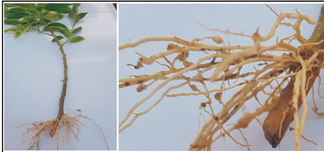
Fig. 1: Root Galling Symptoms on Night-blooming Jasmine Roots.

• Signs and Symptoms: In general, the symptoms of the infected plants did not differ from other common symptoms of root-knot nematodes such as wilt, yellowing and poor vigor. Different root-knot sizes and numbers of the main and sub roots were observed in all tested plants. Some small lesions were also observed in some infected