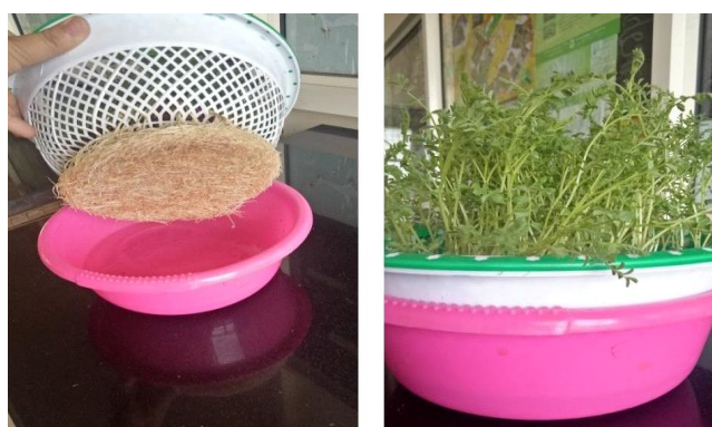
Fig. 1: Profuse Rooting and shooting growth of Cicer arietinum seed on 10 th day of hydroponics experiment in nutrient solution.

Seeds of chickpea were soaked in water and solution