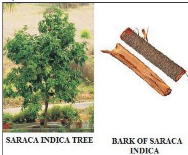
Fig. 1: Image of Saraca indica plant and bark.

g), lung (1.43 g/100 g) and spleen (0.55 g/100 g) weight due to challenge of Freund’s adjuvant. EEBSI and AQEBSI with 3 different doses as mentioned above have