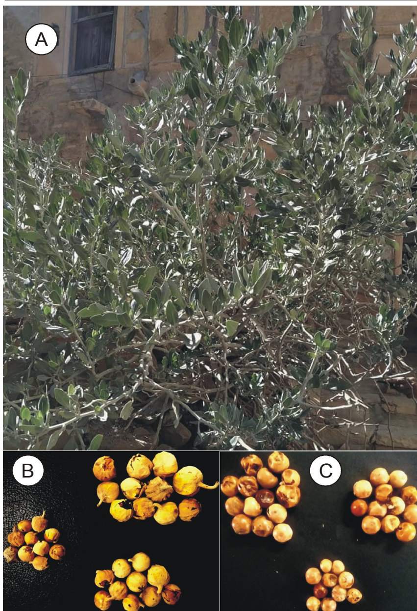
Fig. 1: A. Plant habit; B. Fruit size with leathery calyx; C. Fruit categories.

(2.34 mg) respectively (Tables 1, 2 & 3).