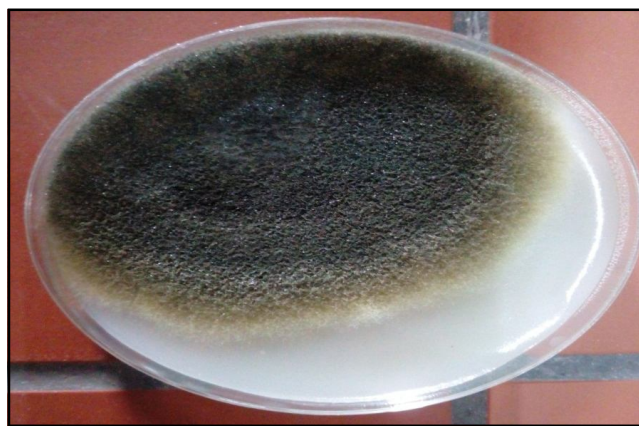
Fig. 2: Aspergillus sp. On Avena sativa agar incubated at 28°C for 72 h.