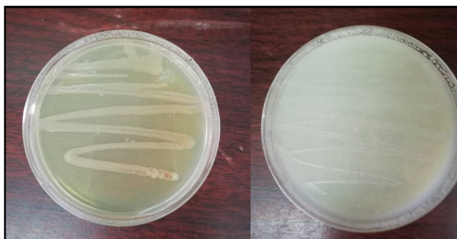
Fig. 4: Serratia spp A: On Avena sativa agar, B: Nutrient agar incubated at 37°C for 24 h.