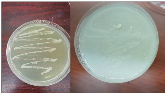
Fig. 5: Escherichia coli , A: On Avena sativa agar, B: Nutrient agar incubated at 37°C for 24h.