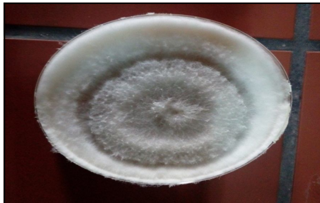
Fig. 1: Fusarium sp. On Avena sativa agar incubated at 28°C for 72 h.

Staphylococcus aureus , Escherichia coli , Serratia sp. Salmonella sp., on Avena sativa agar as shown in Figures (Peterson, 2001; Peterson, 2004; Simpson, 2006; Verardo, 2011). This is the first study conducted in Iraq and the world, which used Oat to prepare medium that use for growth of some fungi and bacteria. Many studies have been performed to formulate a culture medium that is effective for the presumptive isolation of fungi and bacteria isolates. This study prepared new medium, oat agar, composed by a few components, which were of low cost, easy to prepare and able to show growth of