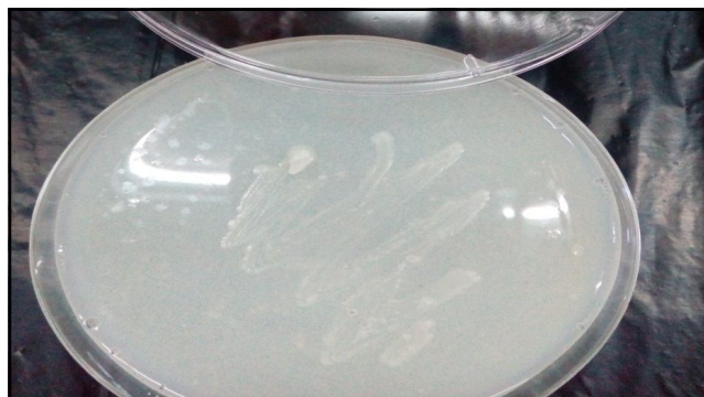
Fig. 3: Candida albicans On Avena sativa agar incubated at 37°C for 48 h.