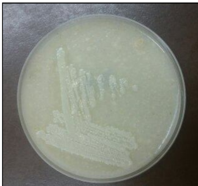
Fig. 7: Salmonella sp On Avena sativa agar incubated at 37°C for 24 h.

The ability of microorganisms to grow on the oat medium is attributed to the oat core having more fat than wheat and protein (34%) and it contains many amino acids such as arginine, allicin and tryptophan. Oatmeal contains vitamin B of particular importance, as it works to produce glucose, as it secretes an enzyme that contributes to the oxidation of sugar and contains many minerals such as iron and phosphorus, especially manganese by 233% and also contains starch and carbohydrates by 233%. Whole oat groat contained high amounts of valuable nutrients such as soluble fibers, proteins, unsaturated fatty acids, vitamins, minerals, and other phytochemicals. Each 100g of oat groat contained