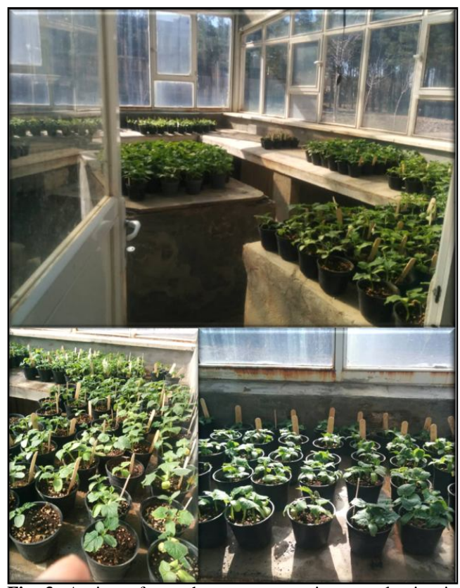
Fig. 3: A view of greenhouse survey using pot planting in Isfahan region.