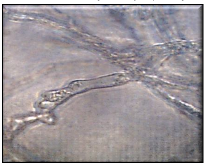
Fig. 6: A finger likes porangium of Pythium aphanidermatum.