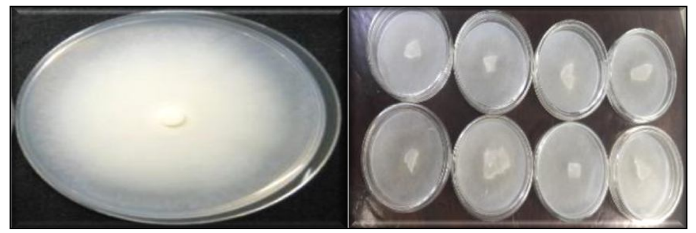
Fig. 5: Colony of Pythium aphanidermatum on Corn Meal Agar medium.