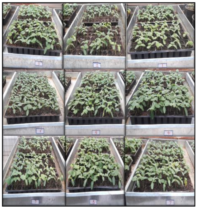
Fig. 1: A view of greenhouse survey using transplanting trays in Tehran.

The six fungicides were used by the soil drench method in two times, after the cotyledon stage with the emergence of the first true leaf and the two-leaf time, so that the surface and the whole soil volume were completely impregnated with the fungicide solution. The fungicides of redoxil GR5% (metallaxil), ridomex GR5% (metallaxil) and Downy-G WP72% (metalaxil+ mancozeb) were used at 2g/L dose. Previcur energy SL84% (fosetyl aluminum + promocarp hydrochloride) was applied at 3ml/L dose. Mancolaxyl was used at 1.5, 1.75 and 2 g/L doses. The application level of fungicides at each turn was adjusted to 1 liter for each planting tray, and for each pot based on the calibration and volume of