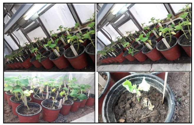
Fig. 2: A view of greenhouse survey using pot planting in Varamin region.

water used to cover the surface and the total soil volume of the pot. In each region, the study was carried out using the seed Sultan variety in January 2018.