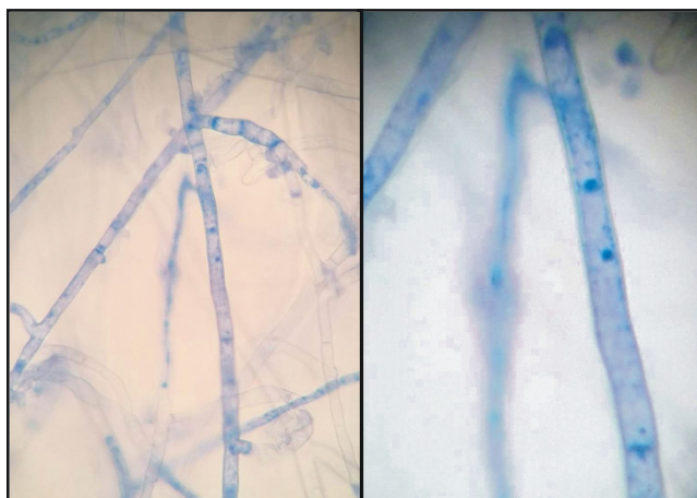
Fig. 1: Binucleate cells of Rhizoctonia spp. dyeing by Aniline blue.

pathogens isolates, where the disease index average of the fungi isolates has reached between 3.55-5.00 according to the disease index that described by (Sneh et al. , 2004), (Table 1). Isolates R5, R6, Rs7, Rs11 isolated from soil and from potato plants prevented germination of radish seeds on PDA medium and their disease index was 5 according to the approved index, while the germination percentage in the comparison treatment was 100%.