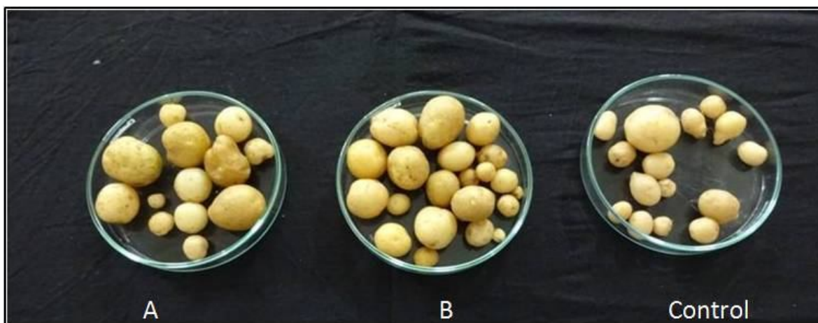
Fig. 2: Effect of PGPR strain PGLO9 on potato yield. A: Strain inoculated on tuber, B: Strain inoculated on sand